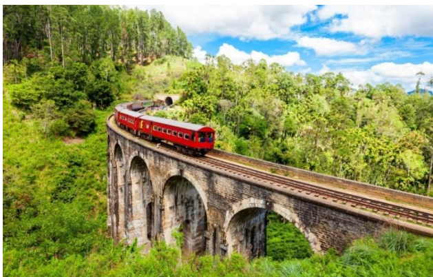
Nine Arch Bridge, Ella