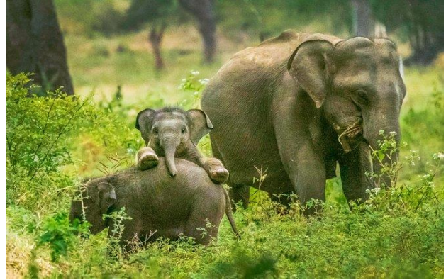
Yala National Park