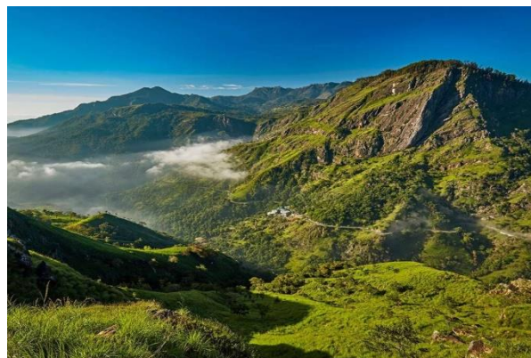
Little Adams Peak, Ella