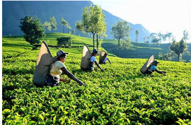
Tea Pluckers at Nuwaraeliya