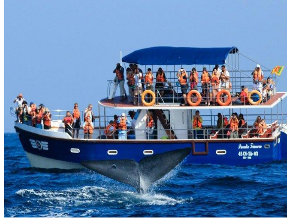
Whales Watching at Mirissa Beach