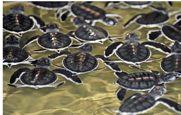
Turtle Hatchery at Kosgoda