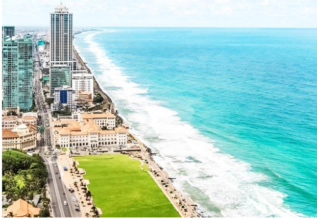
City of Colombo & Galle Face Green