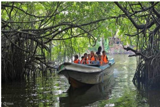
Madu River Boat Safari