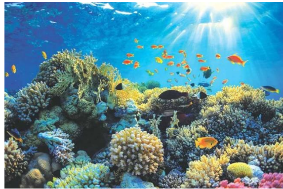
Hikkaduwa Coral Reef