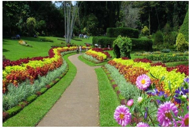
Royal Botanical Garden