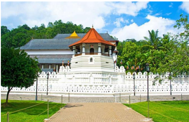
Temple of the Sacred Tooth