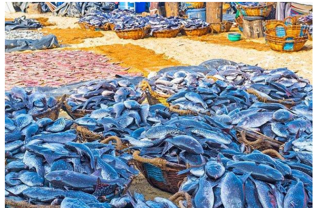
Negombo Fishing Village