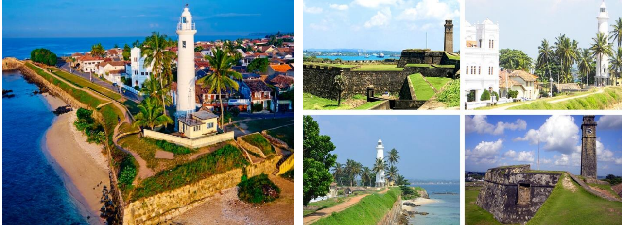
Sightseeing at Galle Fort