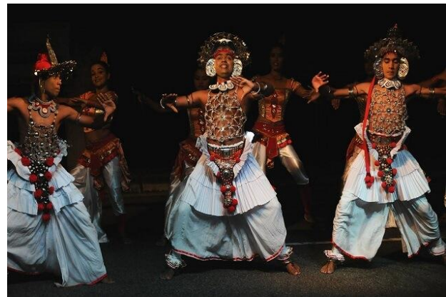
Cultural Dancing Show