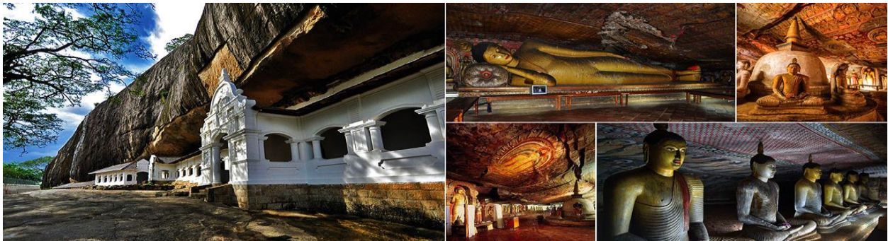
Dambulla Cave Temple