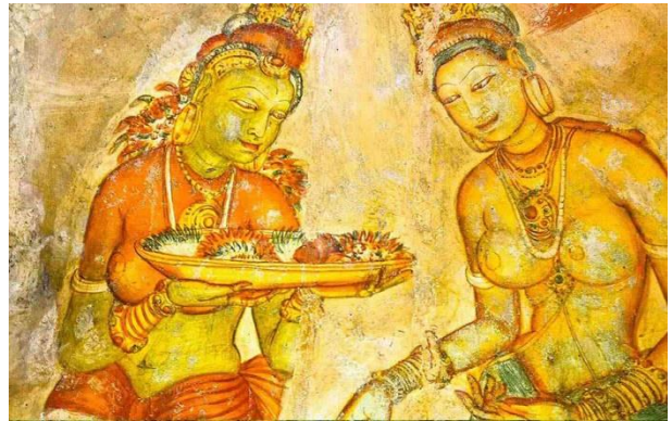
Frescoes of Sigiriya