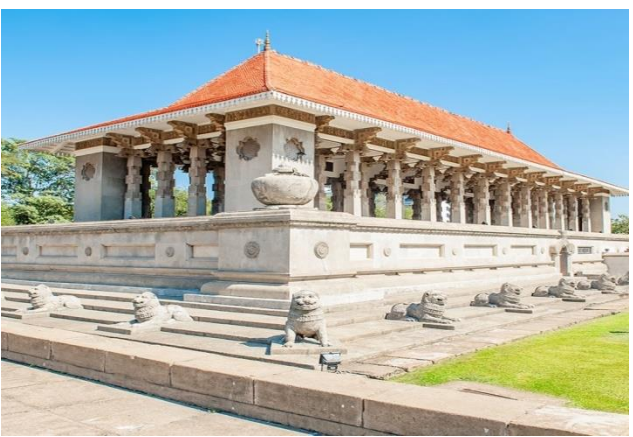
Galle Face Green