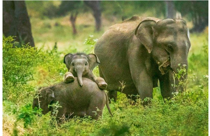
Yala National Park