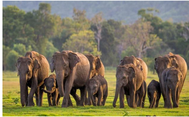
Minneriya National Park