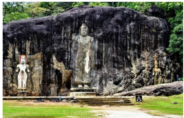
Buduruwagala Ancient Buddhist Temple