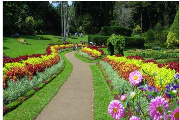
Peradeniya Botanical Garden