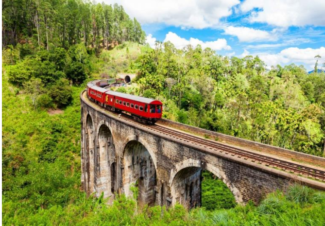
Nine Arch Bridge